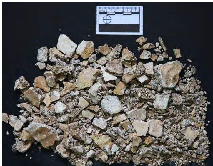
Fig. 2. High degree of fragmentation of the skull of M2. Gradul ridicat de fragmentare al craniului din M2.

Privire de ansamblu, in situ , a mormântului colectiv descoperit la Tărtăria.