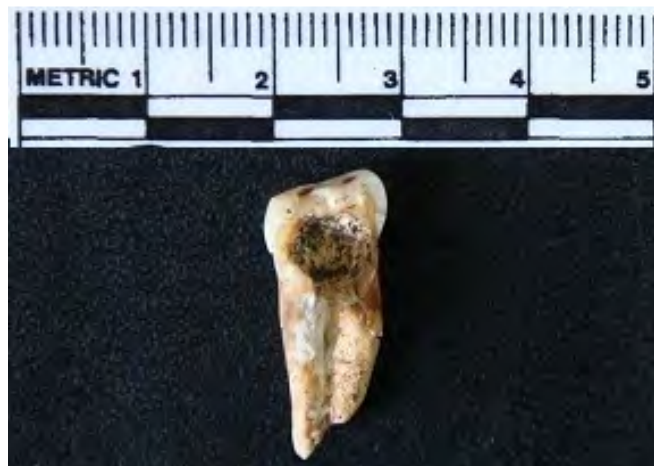
Fig. 4. Carious lesions identified at the first right mandibular molar (M3 individual). Leziuni carioase identificate la nivelul primului molar mandibular dreapta (individul M3).