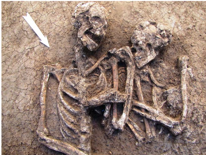
Fig. 6. Subfossil DNA analysis of individuals assign to M5 and M6 can edify us on the relationships of biological relatedness Analiza ADN-ului subfossil al indivizilor atribuiți M5 și M6 ne poate edifica asupra relațiilor de înrudire biologică.