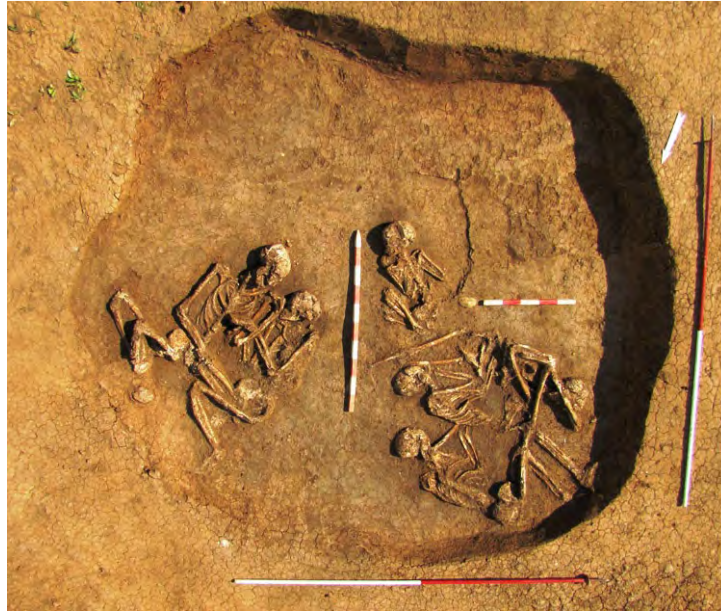
Fig. 1. Overview, in situ , of collective tomb discovered at Tărtăria.

Privire de ansamblu, in situ , a mormântului colectiv descoperit la Tărtăria.