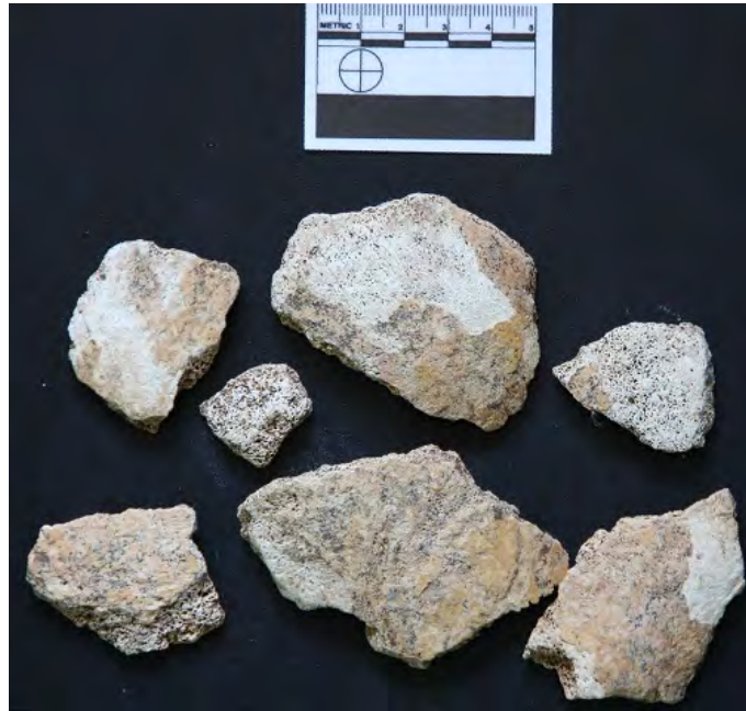
Fig. 3. Taphonomic changes at skull bones (endo- and exocranial) at the individual of M2. Modificări tafonomice la nivelul oaselor craniene (endo- și exocranial) la individul din M2.